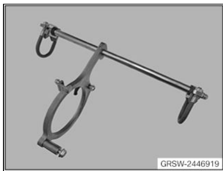
Turbocharger Alignment Tool Order P/N 83 30 2 446 919 Price= $267.81

Distribution of the following tool will be through the Automatic Tool Shipment Program. Additional tools may be purchased through your Regional Distribution Center (RDC). All prices in this bulletin are introductory prices and are only valid during the Automatic Tool Shipment.