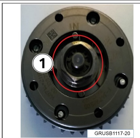
Central Valve VANOS Short (1) produced before 8/2017 with 22mm hex head.

Parts descriptions in the Electronic Parts Catalog (EPC) have been modified to indicate the difference between the early design (1) and the later design (2).